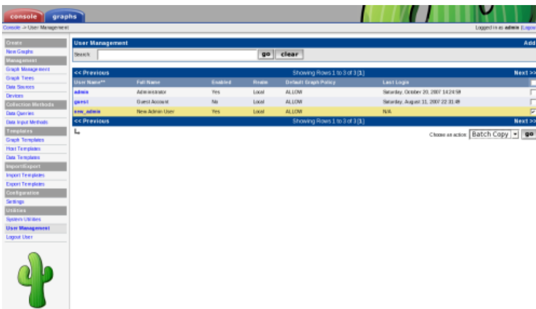
Figure 9-8. Batch Copy Users Part 1

Batch Copy is a helpful utility that helps Cacti Administrators maintain users. Because Cacti does not yet support groups, it is important that there is some way to mass update users. This what Batch Copy does for you.